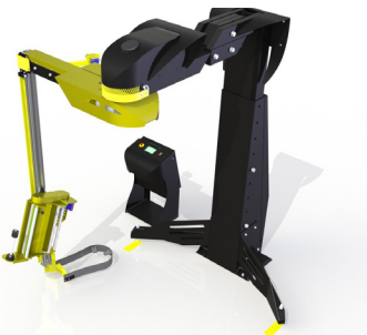
The rotating arm can be easily adjusted to achieve a wrapping diagonal of 78" or 87"; offering extreme versatility at no additional cost.

Four individual wrap programs can be stored using the touch screen HMI for simple operation of the machine. The programs include eight functions which can be adjusted to meet the demands of the most challenging applications. The tilted carriage design wraps down to within 2 3/4" from the floor, wrapping loads securely to the pallet.