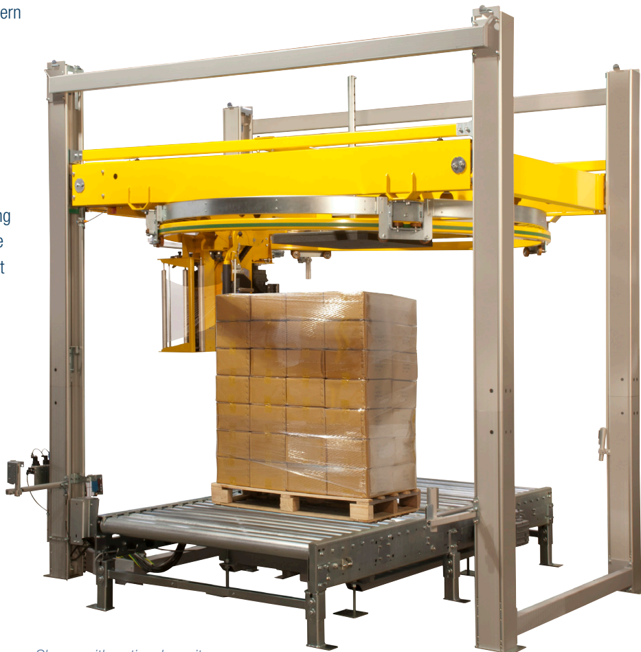
Shown with optional gravity type load stabilizer.

Compact, aluminum frame structure along with a well balanced ring and belted lifting device results in quiet, efficient performance and minimal maintenance