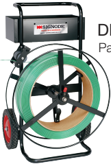
DF-X dispenser Part Number: 429220