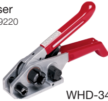
WHD-34 tensioner Part Number: 425380