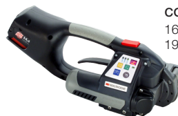
BXT2-16/19 battery powered combination tool 16-Part Number: 428340 19-Part Number: 428350