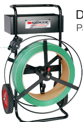
DF-X dispenser Part Number: 429220

5/8" x .035" (2X2229*), 5/8" x .040" (2X2237*) and 3/4" x .040" (2X2233*) strapping