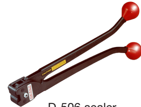
D-506 sealer Part Number: 023820