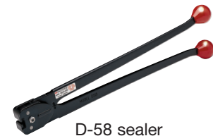
D-58 sealer Part Number: 423800