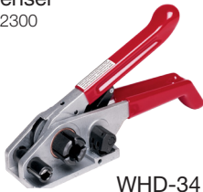
WHD-34 tensioner Part Number: 425380