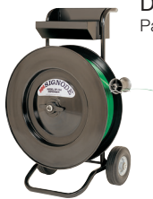
DF-16A dispenser Part Number: 422300