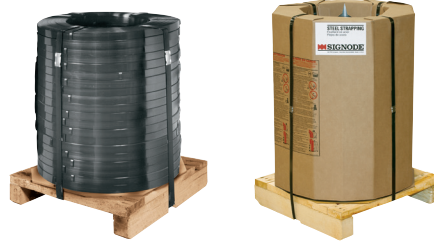
Ribbon wound skid

Twelve mill wound coils make up a standard skid. The number of ribbon wound coils will vary with strapping width.