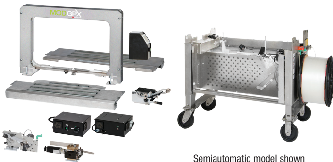
Semiautomatic model shown

Interchangeable modular components simplify maintenance, minimizing service disruptions. Modules can be replaced inline by your own personnel, saving time and money. Locator plates, latches and electrical quick-disconnects ensure secure and precise alignment. And to keep you up and running, we offer a modular repair program . If one of your modules ever needs repair, just give us a call. Our GPX phone specialist will help you determine the repairs necessary and which method would be best for your situation - repaired on-site or at our Repair Center.