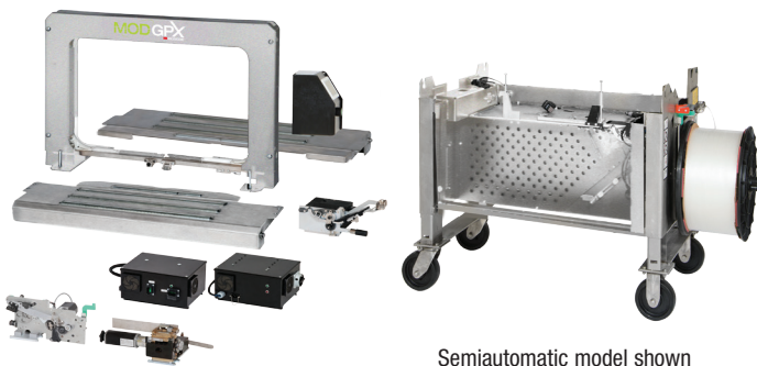
Semiautomatic model shown

Interchangeable modular components simplify maintenance, minimizing service disruptions. Modules can be replaced inline by your own personnel, saving time and money. Locator plates, latches and electrical quick-disconnects ensure secure and precise alignment. And to keep you up and running, we offer a modular repair program . If one of your modules ever needs repair, just give us a call. Our GPX phone specialist will help you determine the repairs necessary and which method would be best for your situation - repaired on-site or at our Repair Center.