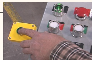
Platen latch button mounted on operator console