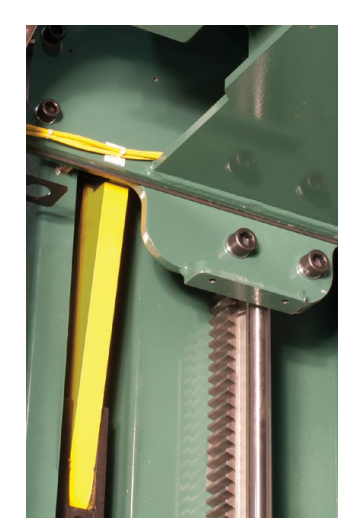
Auto latch conversion: Platen on the latches