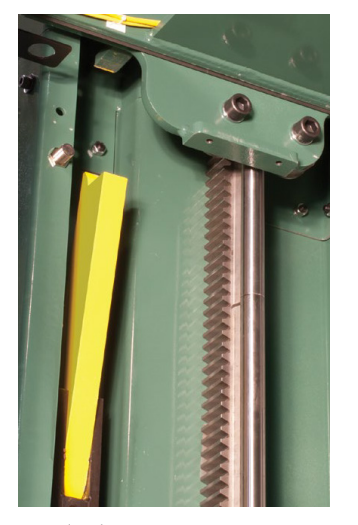
Auto latch conversion: Automatic platen latch activated and extended

Featuring one button operation, these electrically-actuated latches are operator friendly and provide ease of LOTO for clearing strap jams. Always follow your company's LOTO procedures .