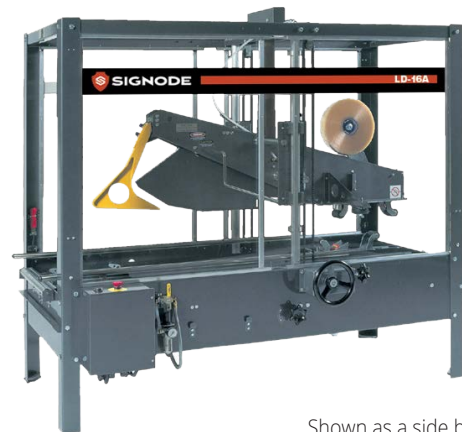
Shown as a side belt version