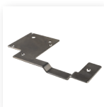
■ Protection plate for usage on abrasive surfaces