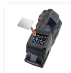
■ Screen protector for additional protection