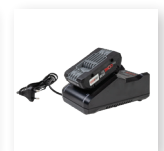
■ Battery Charger for secure and stable charging